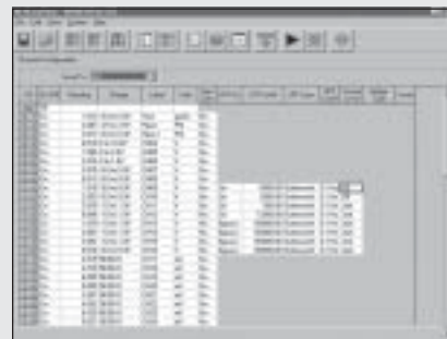
Using WaveView software's spreadsheet-style interface, you can easily set up your application and begin taking data within minutes